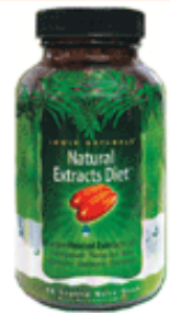
Natural Extracts Diet Natural Extracts Diet contains a powerful combination of natural concentrat

Also called the Stone Age Diet plan, this diet plan is based on the consumption of simple, unprocessed foods that our Neanderthal ancestors would have eaten. This diet plan is perfect for Green Tea drinkers. Green Tea is simple and 100% natural steamed dried leaves from the Camellia sinensis plant. If you’re a coffee drinker, you might be in for a tougher choice since you might have to give up coffee all together with this diet