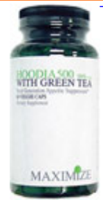
Hoodia 500 mg With Green Tea

The polyphenols found in Chinese diet Green Tea may be held accountable. With its high amount of polyphenols, Chinese diet Green Tea seems to have a stimulating