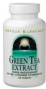
Green Tea Extract 175 mg EGCG 500 mg

Source Naturals Green Tea Extract is standardized for bioflavonoidlike anti