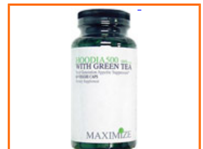
Hoodia 500 mg With Green Tea

Never disregard professional medical advice or delay in seeking it because of something you have read in this ebook or on ANY website.