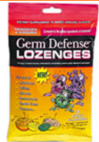
Germ Defense Lozenges

Overall health can often occur naturally if the body receives the proper nu