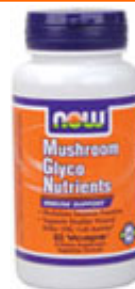
Mushroom Glyco Nutrients

Created for Planetary Herbs by licensed acupuncturist and clinical herbal