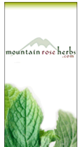
Great Health Sites

Germ Defense Lozenges are dietary supplements used to boost your immune sys