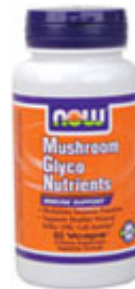
Mushroom Glyco Nutrients

Created for Planetary Herbs by licensed acupuncturist and clinical herbal