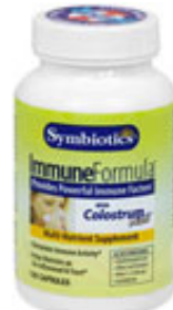
Colostrum Plus Immune Symbiotics Multi-Nutrient Immune Formula provides extra support