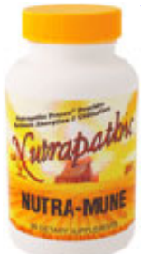
Nutra-Mune Nourish your defense system with Nutrapathics

Are you looking for quality Vitamins , diet aids and health Supplements ? Visit the Health Supplement Shop - highly recommended by NHH!