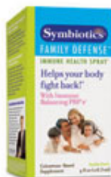
Family Defense Immune Spray

KidShield by Symbiotics has a delicious Tutti Frutti flavor