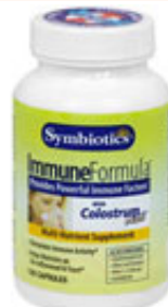
Colostrum Plus Immune

Enhances immune activity. This immune balancing action is