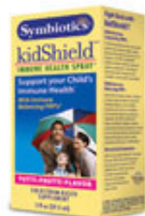
Kidshield Immune Spray

Nourish your defense system with Nutrapathics