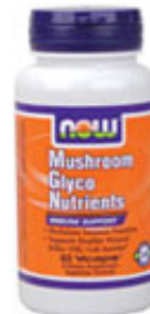
Mushroom Glyco Nutrients

Created for Planetary Herbs by licensed acupuncturist and clinical herbal