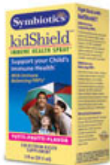
Kidshield Immune Spray KidShield by Symbiotics has a delicious Tutti Frutti flavor