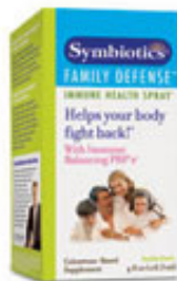
Family Defense Immune Spray Enhances immune activity. This immune balancing action is