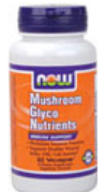
Mushroom Glyco Nutrients

Created for Planetary Herbs by licensed acupuncturist and clinical herbal