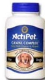
Canine Complex ActiPet Canine Complex is the most complete multi vitamin and mineral formu