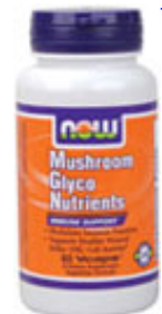
Mushroom Glyco Nutrients

Created for Planetary Herbals by licensed acupuncturist and clinical herbal