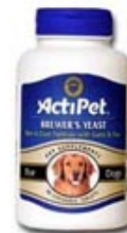
Brewer's Yeast ActiPet Brewer's Yeast Chewables, with Garlic and Flax are specially formu