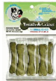
Breath-A-Licious small Dancing Paws Breath-A-Licious bones contain sodium tripolyphosphate to help

Studies indicate that a staggering 40 percent of domesticated canines in the