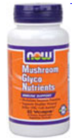
Mushroom Glyco Nutrients NOW® Mushroom GlycoNutrients is a nutritional supplement designed to support

For Guaranteed, Effective, 100% Natural Herbal Remedies , please visit Native