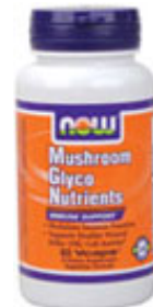
Mushroom Glyco Nutrients NOW® Mushroom GlycoNutrients is a nutritional supplement designed to support

At Native Remedies , we have all had personal experience of nicotine addiction and withdrawal. As a psychologist, I have also counseled many people who have struggled