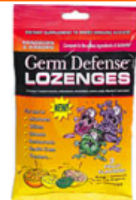
Germ Defense Lozenges Germ Defense Lozenges are dietary supplements used to boost your immune sys