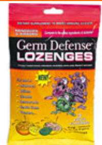
Germ Defense Lozenges

Overall health can often occur naturally if the body receives the proper nu