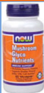
Mushroom Glyco Nutrients

Created for Planetary Herbals by licensed acupuncturist and clinical herbal