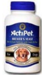
Brewer's Yeast ActiPet Brewer's Yeast Chewables, with Garlic and Flax are specially formu