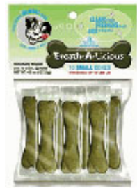
Breath-A-Licious small Dancing Paws Breath-A-Licious bones contain sodium tripolyphosphate to help

In addition to preventative measures – avoiding the midday sun, sufficient hydration and adequate shade – there are a wide variety of natural and homeopathic remedies that can help prevent heatstroke in your