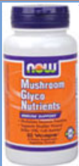
Mushroom Glyco Nutrients

Created for Planetary Herbals by licensed acupuncturist and clinical herbal