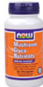
Mushroom Glyco Nutrients

The answer, believe it or not, is to eat more! This will 'trick' our body into increasing